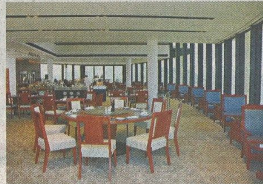
The expanded Horizons restaurant with panoramic sea view.