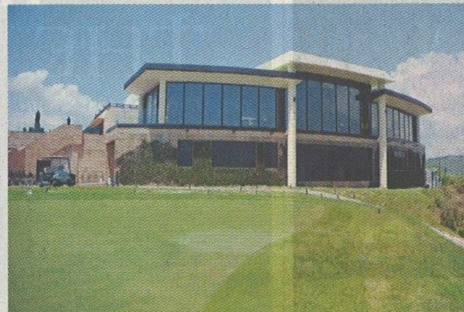
The golf course and clubhouse facilities have been revamped to cater for the 120-strong field.